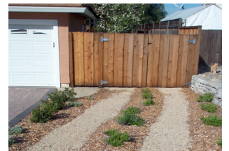
Wheel track driveway with gravel pavement

Local example of pavers with open joints: 735 Homer Avenue in Palo Alto 1 .