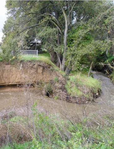
Erosion may result from increases in the amount and rate of runoff entering a creek.