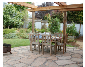
Flagstone with permeable joints