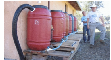
Rain barrel system