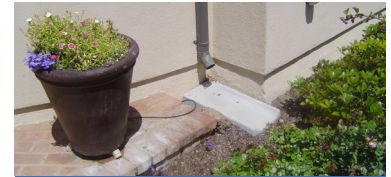
Splash block directs water to landscaping.

Runoff can also be captured in a rain barrel and used later for landscape irrigation. Due to West Nile virus concerns, ask your county vector control office about standing water regulations and recommendations before installing a rain barrel or cistern. Contact Santa Clara County Vector Control office at (408) 918-4770 or (800) 675-1155.